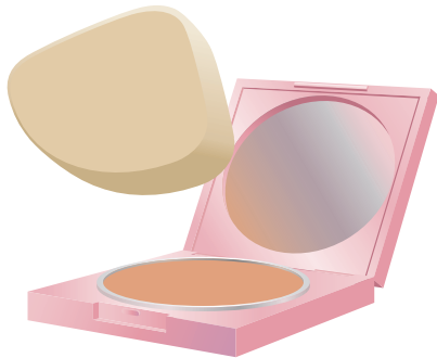
Ultimate Performance professional foundation

with my Ultimate Performance professional foundation, Honey, you are READY!!!